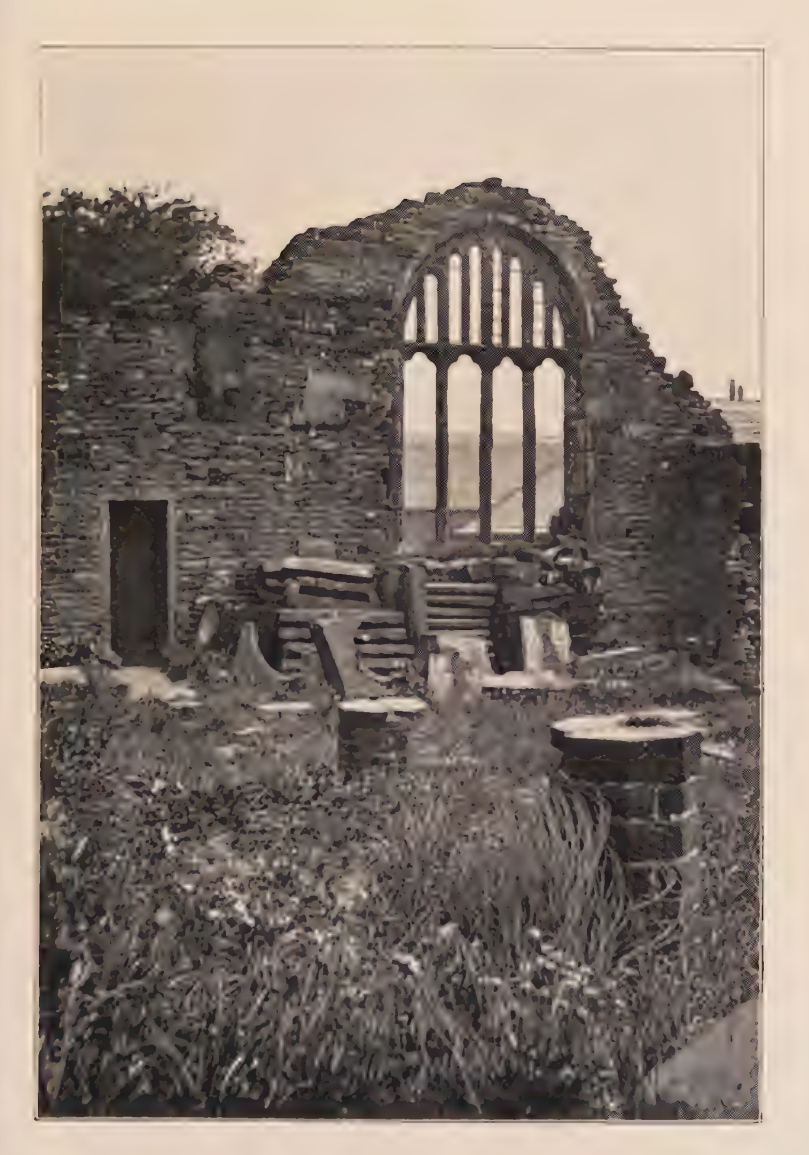
THE BELL CHAPEL, THORNTON.